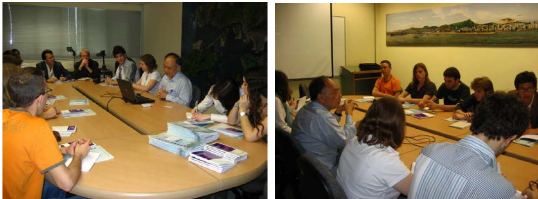
Students from Université Paris 1 Panthéon-Sorbonne exchanged ideas with the Centre’s Director