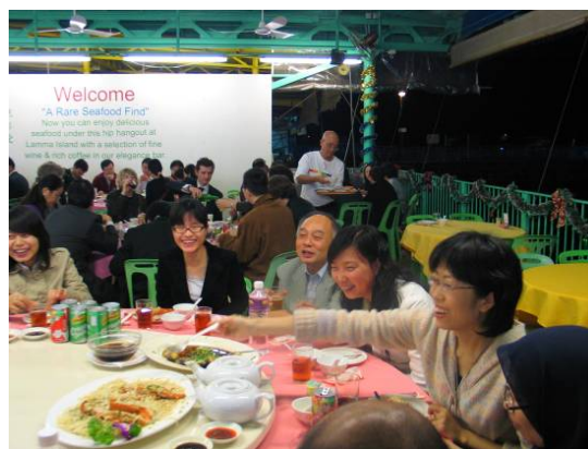
Conference dinner at Lamma Island