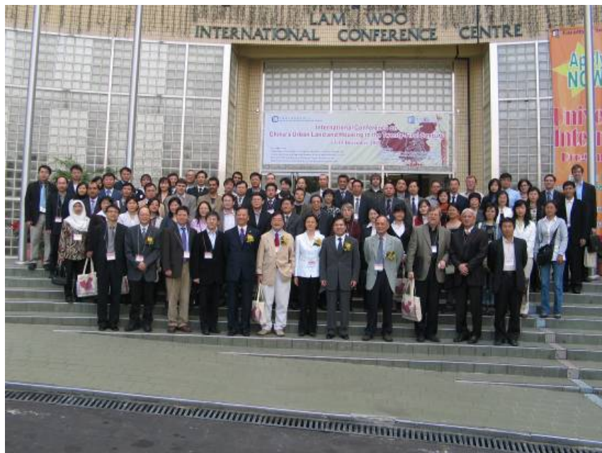
Group photo in the conference, 13 December 2007

A three-day international conference on “China's Urban Land and Housing in the 21 st Century” was successfully hosted by the Centre for China Urban and Regional Studies, Hong Kong Baptist University, on 13-15 December 2007. Co-organizers include the Department of Geography, Hong Kong Baptist University; the Centre for Urban and Regional Studies, Sun Yat-sen University; the School of City and Regional Planning, the University of Cardiff; and the Spatial Structure in the Social Sciences, Brown University.