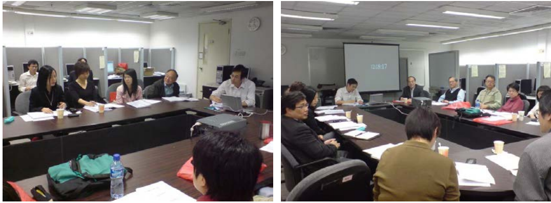
Book Project Workshop with contributors, publishers and MSc students discussing the contents of individual chapters, 10-11 January 2008